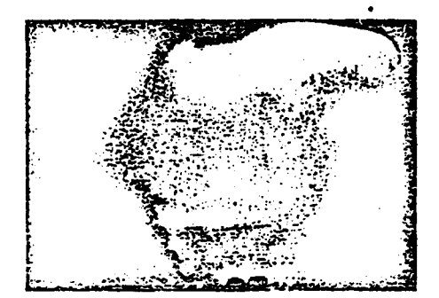
The UFO about to pass behind a nearby tree . . .

In IUR, Vol. 2, No. 11, the Foreign Forum feature mentioned a case wherein a Guatemalan camera crew videotaping a car commercial turned